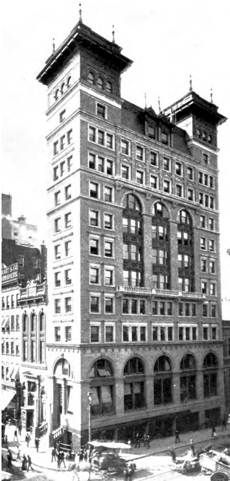
The National Shoe and Leather Bank in NYC