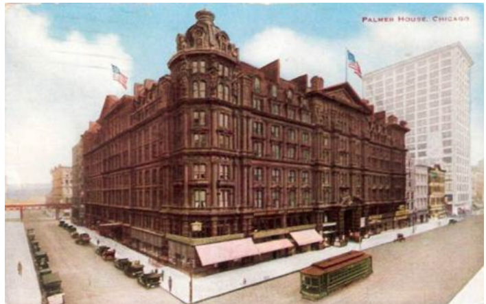
Palmer House Hotel, Chicago, 1913