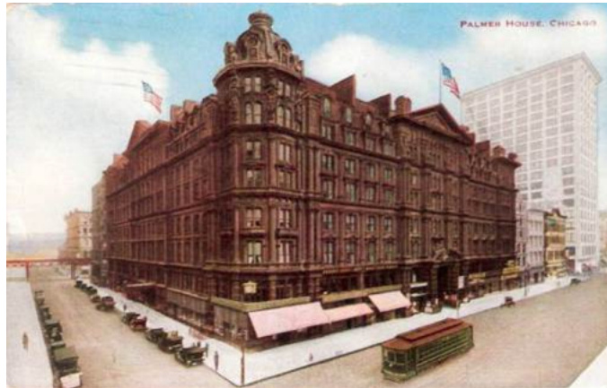
Palmer House Hotel, Chicago, 1913

A local organizing committee is now working on the many details involved in an event of this scale and a program committee is in formation. Volunteers are always welcome.