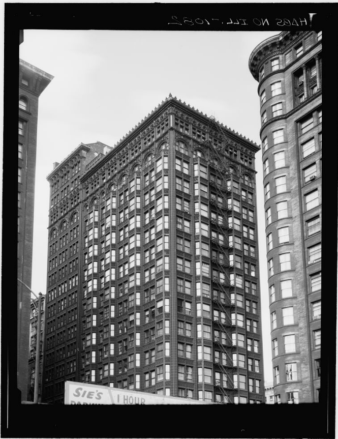
The Fisher Building in Chicago

On June 22, the Western Great Lakes Chapter of the Association of Preservation Technology and the Construction History Society of America co-hosted an afternoon-long event entitled Skyscraper History: Looking Back While Looking Up . Presenters included preservationists and contemporary engineers and architects working at the cutting edge of skyscraper design, all emphasizing the continuity between the towers of the nineteenth century and those of the twenty-first.