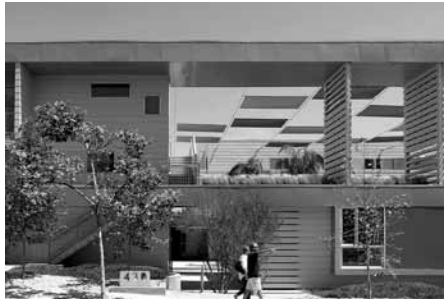
Pico Place, Santa Monica, CA