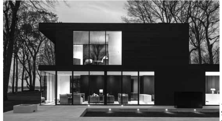
Lake Minnetonka Retreat Home