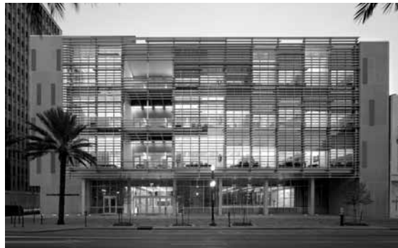
New Orleans BioInnovation Center, New Orleans LA