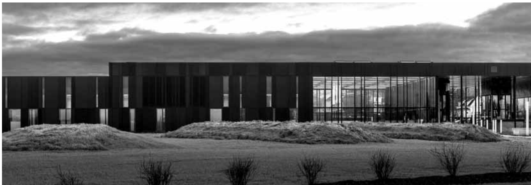
Van Buren LPOE