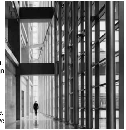
Queens Civil Courthouse, New York

a founding partner of Perkins Eastman and plays a key role in the overall design direction of the firm while she also is the Managing Principal of the New York Office. She is involved in the firm's healthcare, higher education, public building, and housing design practices. Integrating architecture and interior design to create significant spaces and humanizing institutional environments are central to her professional practice. Her design innovation and sensitive approach have redefined state-of-the-art in healthcare, and have been recognized with nearly every major award for design excellence, enhancing the firm's reputation as a leader in the design of programmatically complex buildings. She has been active in the New York Chapter of the AIA, serving as Director and member of the Nominating and Honors committees. She is a board member of the New York Building Congress, the Salvadori Center, and the ACE Mentor Program.