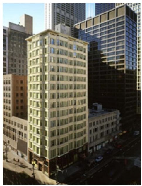
Burnham Hotel, Chicago. (Old Reliance Building)

We are slowly assembling Chicago images that we can use at the website and for other publicity. Please send any suggestions to Tom Leslie.